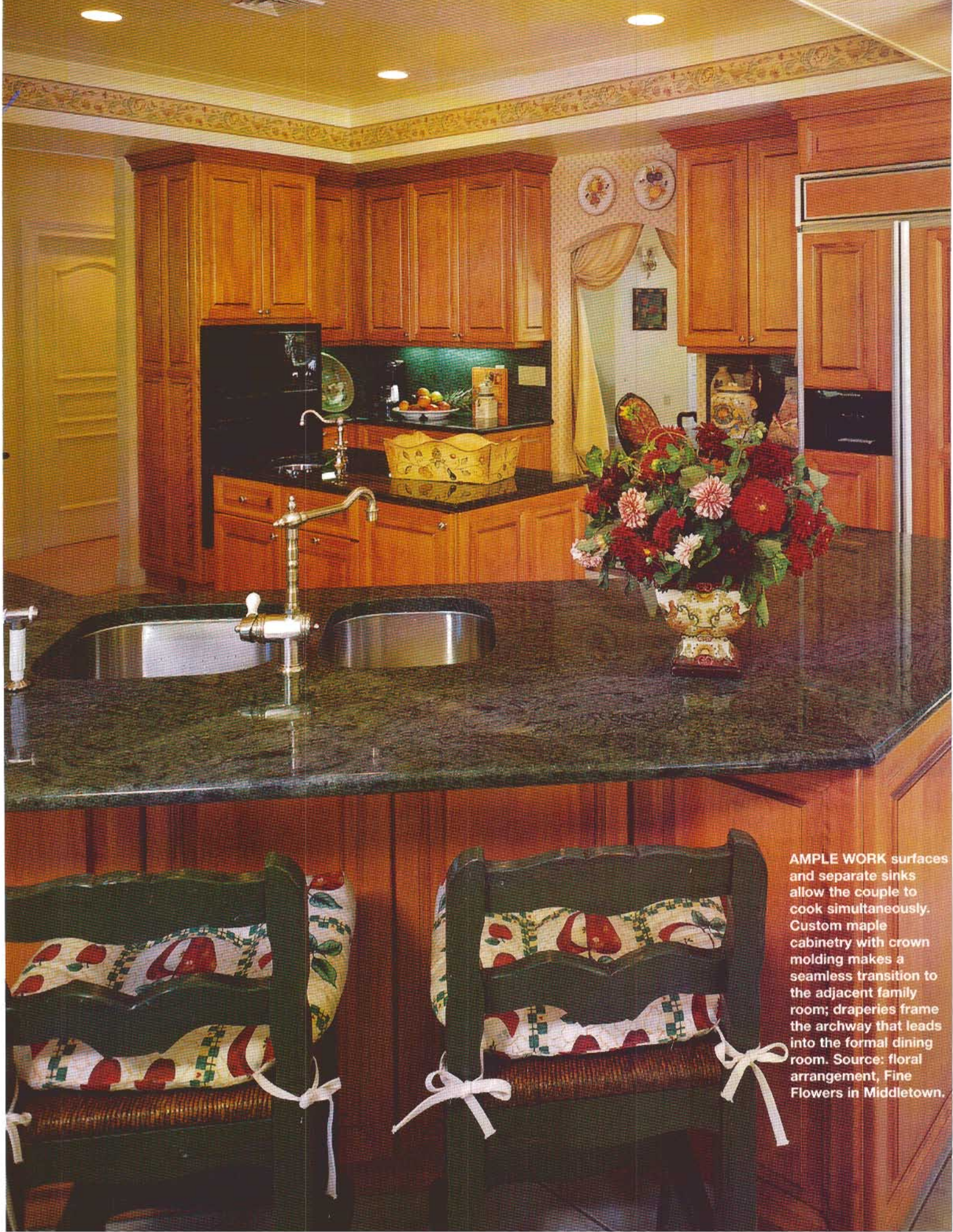
AMPLE WORK surfaces and separate sinks allow the couple to cook simultaneously. Custom maple cabinetry with crown molding makes a seamless transition to the adjacent family room; draperies frame the archway that leads into the formal dining room. Source: floral arrangement, Fine Flowers in Middletown.