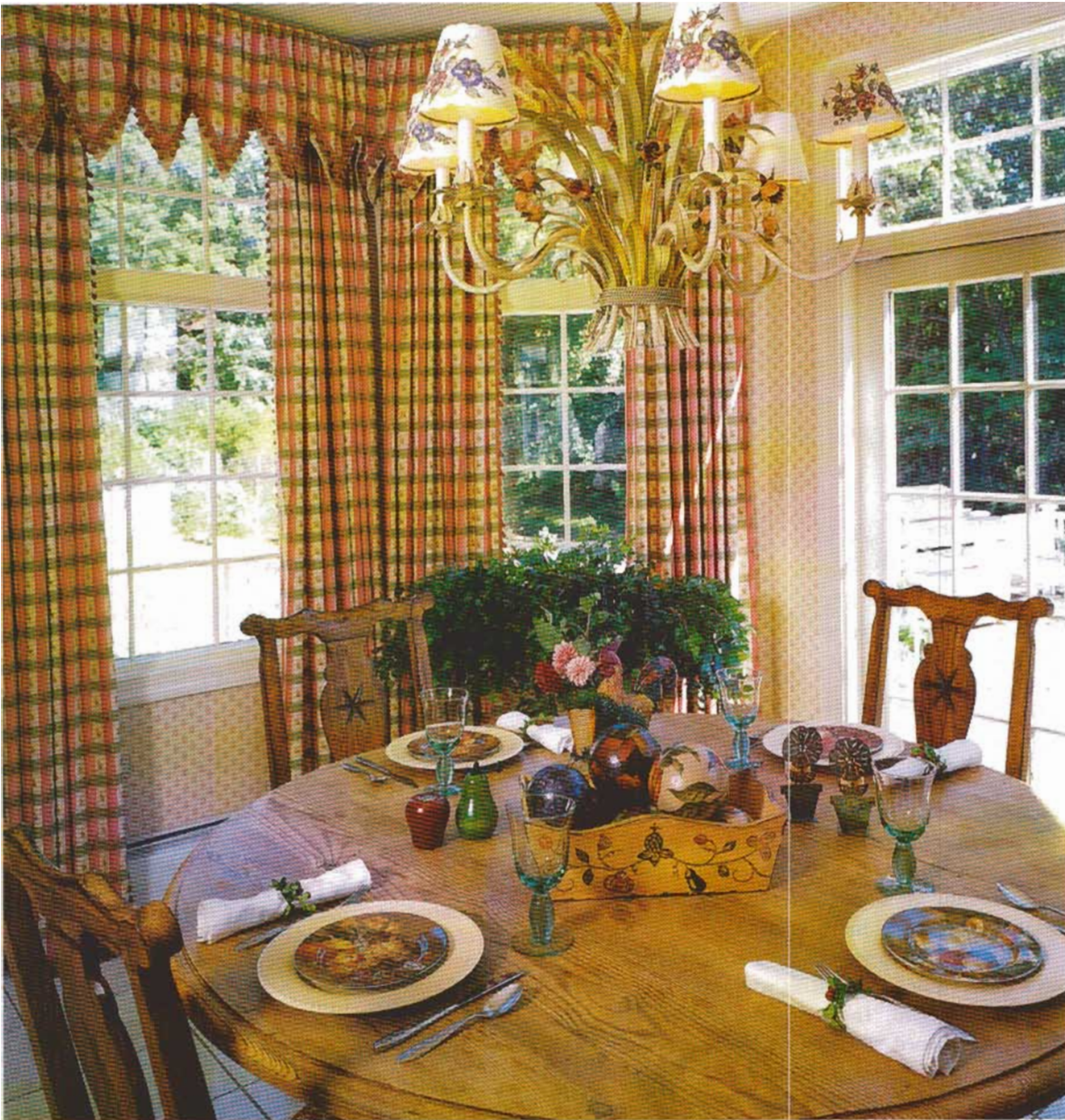
CUSTOM WINDOW treatments in playful patterns and trims enliven the breakfast nook without obstructing outdoor views. Source: light fixture, Hardy Steiner in Shrewsbury.

every inch of living space count. And because the focus was on quality of space, not quantity, the couple budgeted for custom accents and architectural detailing.