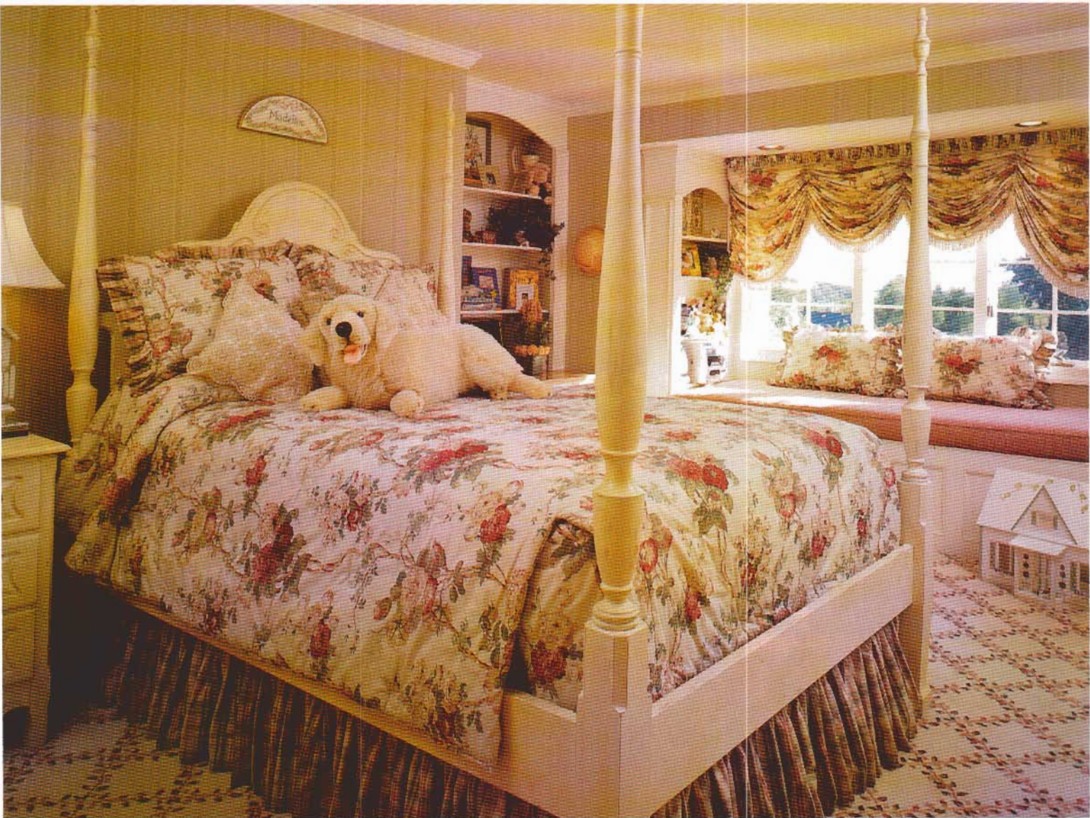
COUNTRY FRENCH furnishings (above) mixed with custom bedding and window treatments provide a cozy retreat for a pre-teen girl. The window seat serves as a place for quiet reading. Artist Richard Davis of Forked River used the younger daughter's room (far right) as a canvas, with a nature-inspired theme gracing his ceiling cameo. The two girls share a feminine bathroom (right) that's outfitted with traditional wallpaper, deep-stained wood cabinets, and a white marble counter. Source: bedding and drapes, Peary Upholstery in Atlantic Highlands.